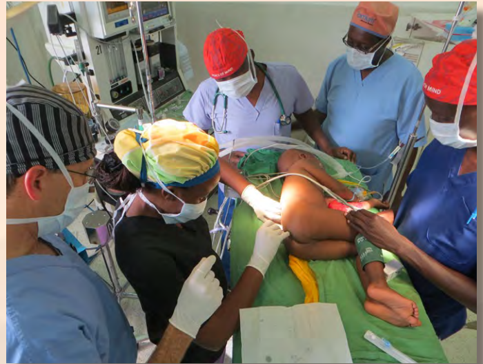
Above: Teaching pediatric regional anesthesia to a fellow from Kenya.