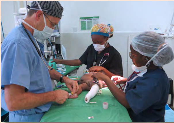
Fellows from Malawi and Kenya learning pediatric anesthesia.