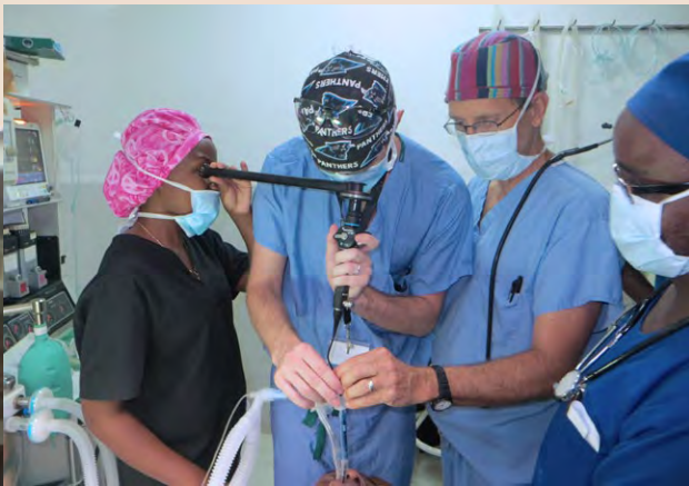
Left: Teaching difficult airway techniques to residents from Kenya and Vanderbilt University.