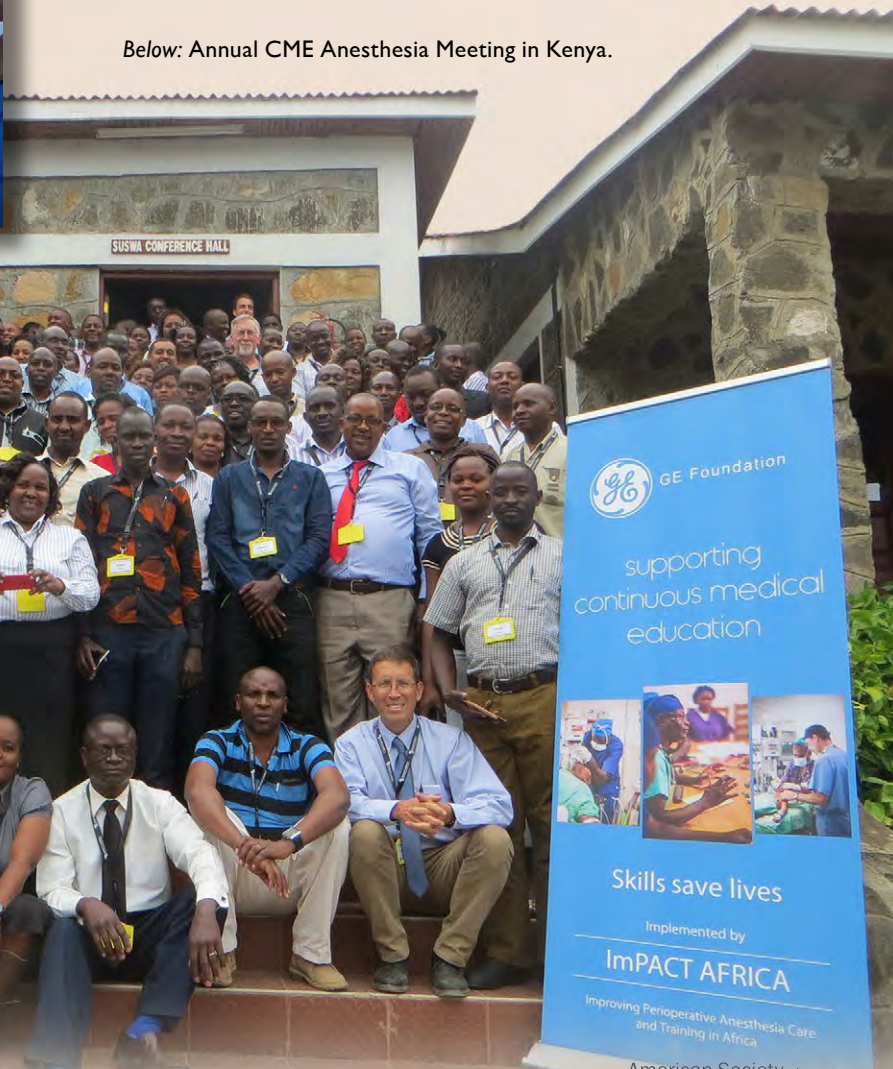
Below: Annual CME Anesthesia Meeting in Kenya.