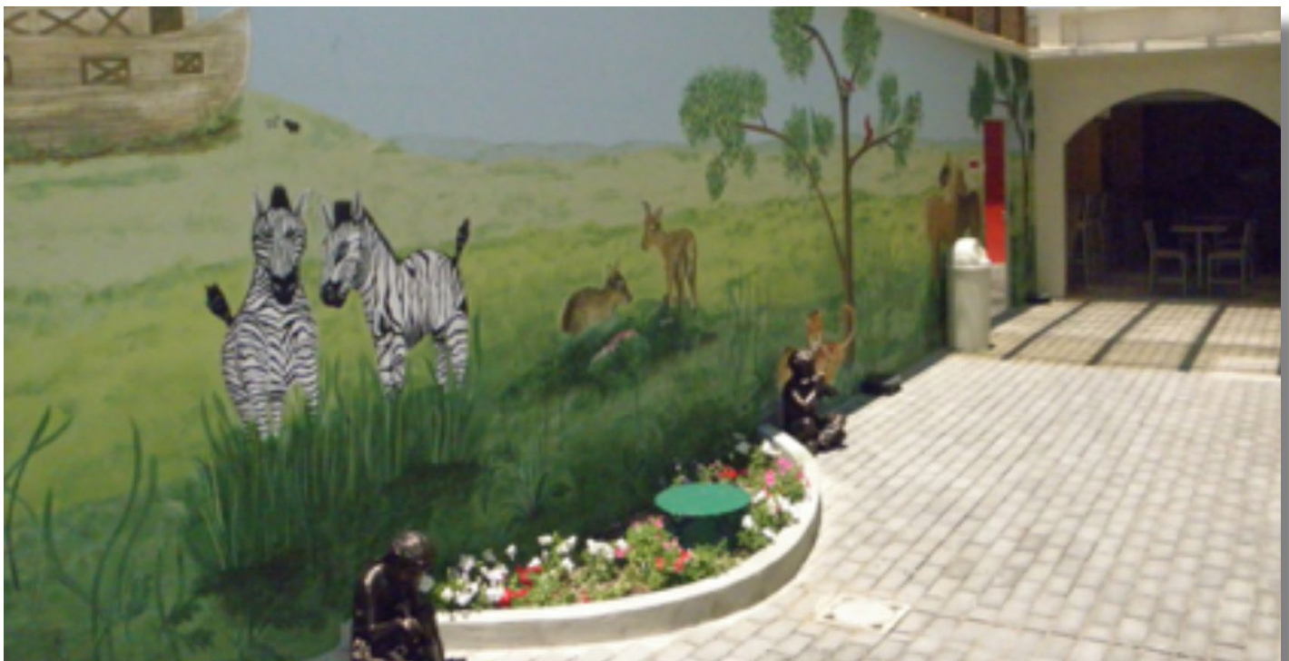
Moore Center Courtyard and café, where families can wait and children can play.