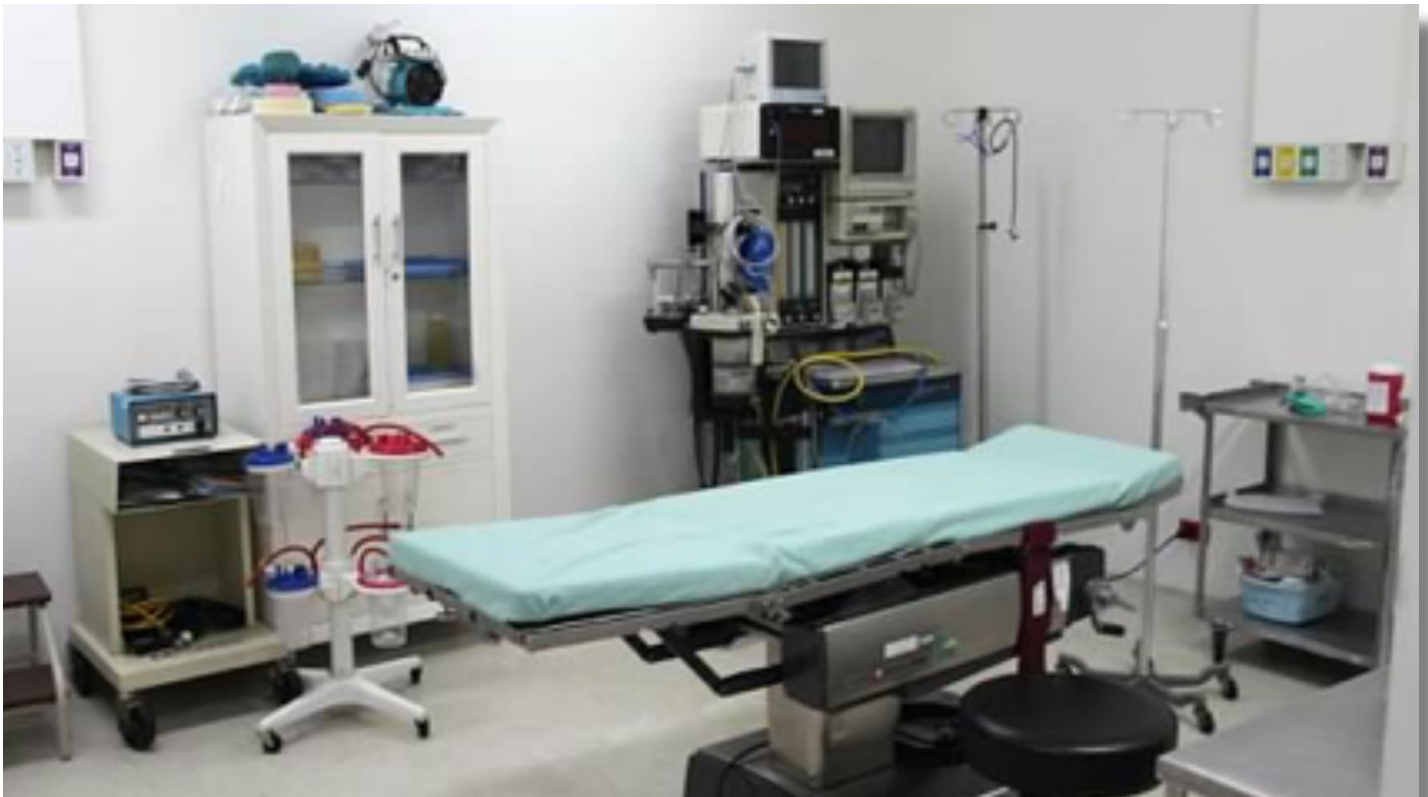
One of three O.R.s available at the Moore Pediatric Surgery Center, with equipment similarly found in the U.S.

Recently, a team of Vanderbilt physicians, nurses and surgical scrub technicians spent six days at the Moore Pediatric Surgery Center in Guatemala City, providing ENT services to 79 children and adolescents. Annually, Vanderbilt sends two surgical teams to the Moore Center, covering several specialties in great demand, including ENT, plastics, orthopedics and urology. During the recent trip, the otolaryngologists screened 106 patients in the preoperative clinic to evaluate them for potential surgery. The screened patients were then evaluated by the physician anesthesiologists in preparation for surgery. Once cleared for surgery, patients were scheduled over the following five days. Surgical procedures included adenotonsillectomy, airway evaluations for subglottic stenosis, and tympanoplasty, among others.